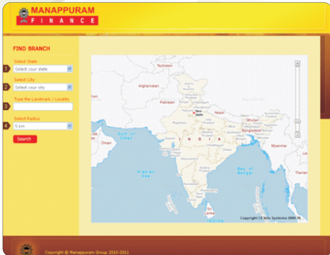
Mannapuram branch Locator and distance Locator